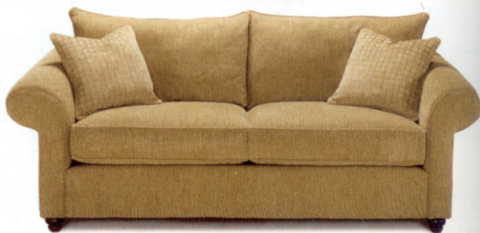
Melbourne sofa by Rowe Fine Furniture. "It's a great transitional piece, mixing traditional lines with contemporary flair." Tamara Criswell, Cleo's Furniture, West Little Rock